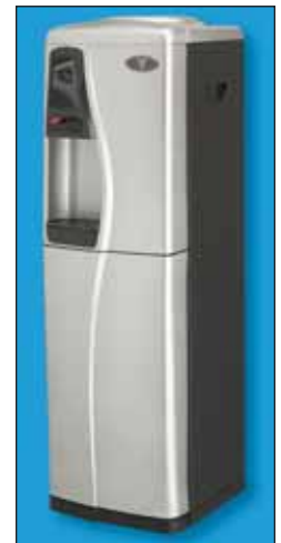
Silver and Black option.